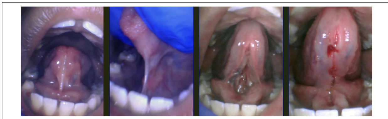
Figure 1. Example of partial versus full release. An 11-year-old child with a tongue restriction (not part of the study) was incompletely released under general anesthesia at age 8 and had persistent speech and sleep difficulty. Notice the impaired function and lift of the tongue (left) and restricted tissue with digital elevation preoperatively (middle left). After a full CO 2 laser release with no bleeding, he can elevate his tongue to the palate (middle right) and final sutured closed result (right).

child with posterior tongue-tie, significant dysphagia, and aspiration improved significantly after release, as imaged by videofluoroscopic swallow study. 14